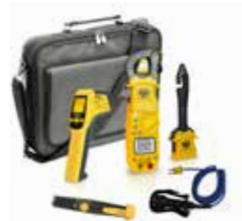
HVACKIT HVAC Clamp-On Meter Kit