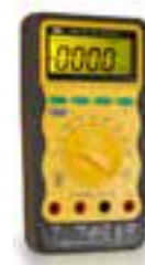
DM391 Digital Multimeter