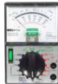
M75A Analog Multimeter