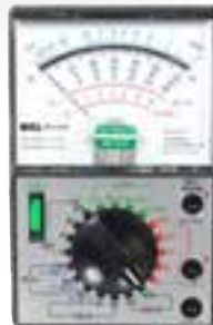
M110A Analog Multimeter