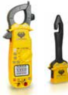
DL389KIT G2PHOENIX PRO CH3 Extended Clamp Head For DL379 & DL389