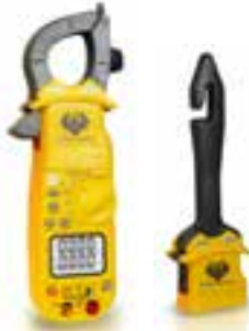
DL379KIT G2PHOENIX PRO CH3 Extended Clamp Head For DL379 & DL389