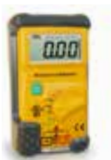
DM200 Digital Multimeter